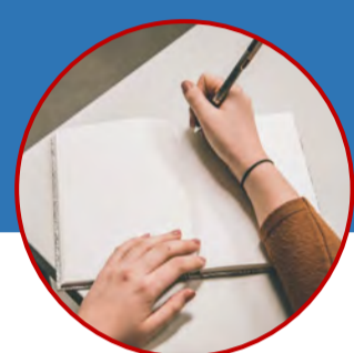
Writing to Argue