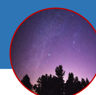
The Curious Incident of the Dog in the Nighttime