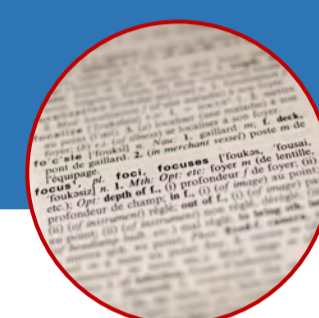
Language Paper 2