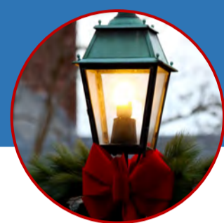
A Christmas Carol