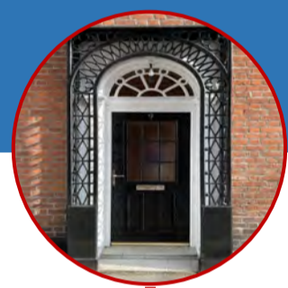
An Inspector Calls