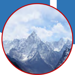
Touching The Void