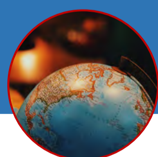
Brand New World