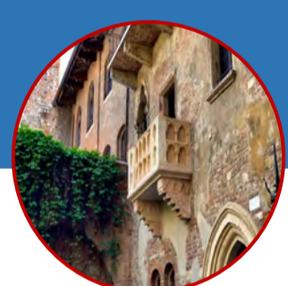
Romeo and Juliet