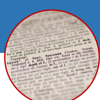
Language Paper 1