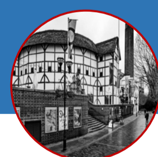
Much Ado About Nothing