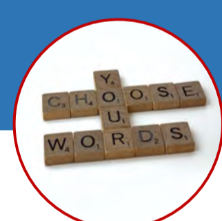
Exploring Word Type